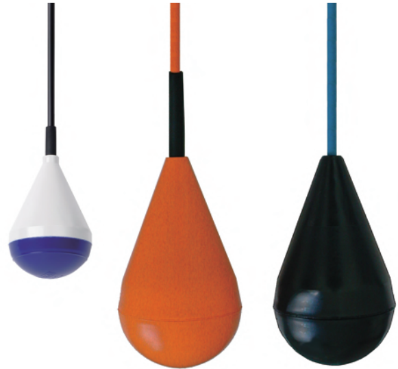
Fig. left: Model SLS-C